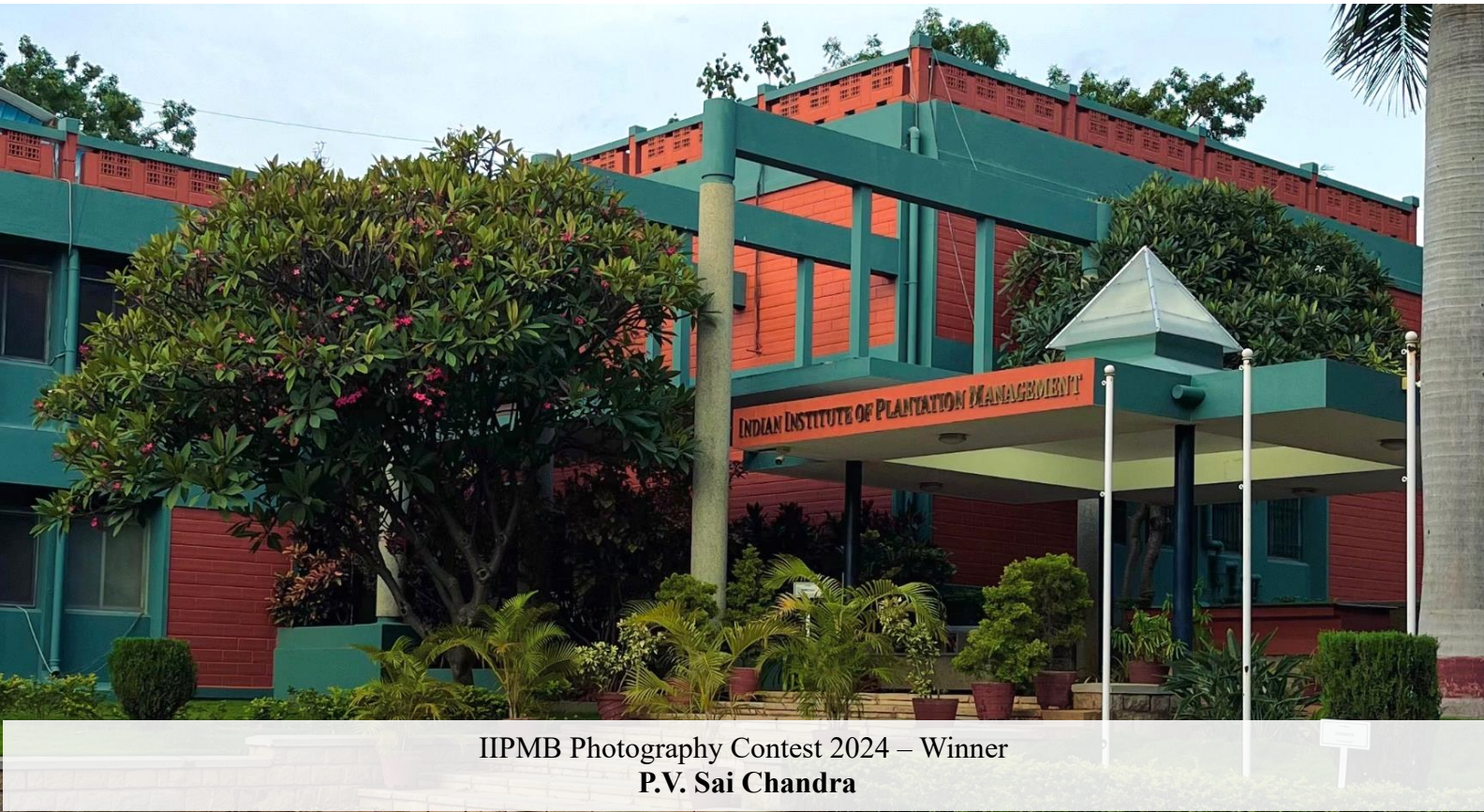
IIPMB Photography Contest 2024 – Winner P.V. Sai Chandra