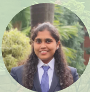
Veni (ABPM 2025-27)